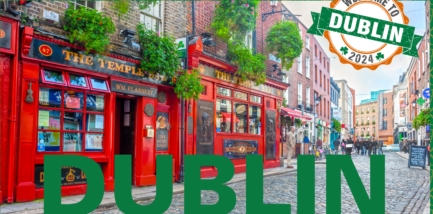
The Westin Dublin